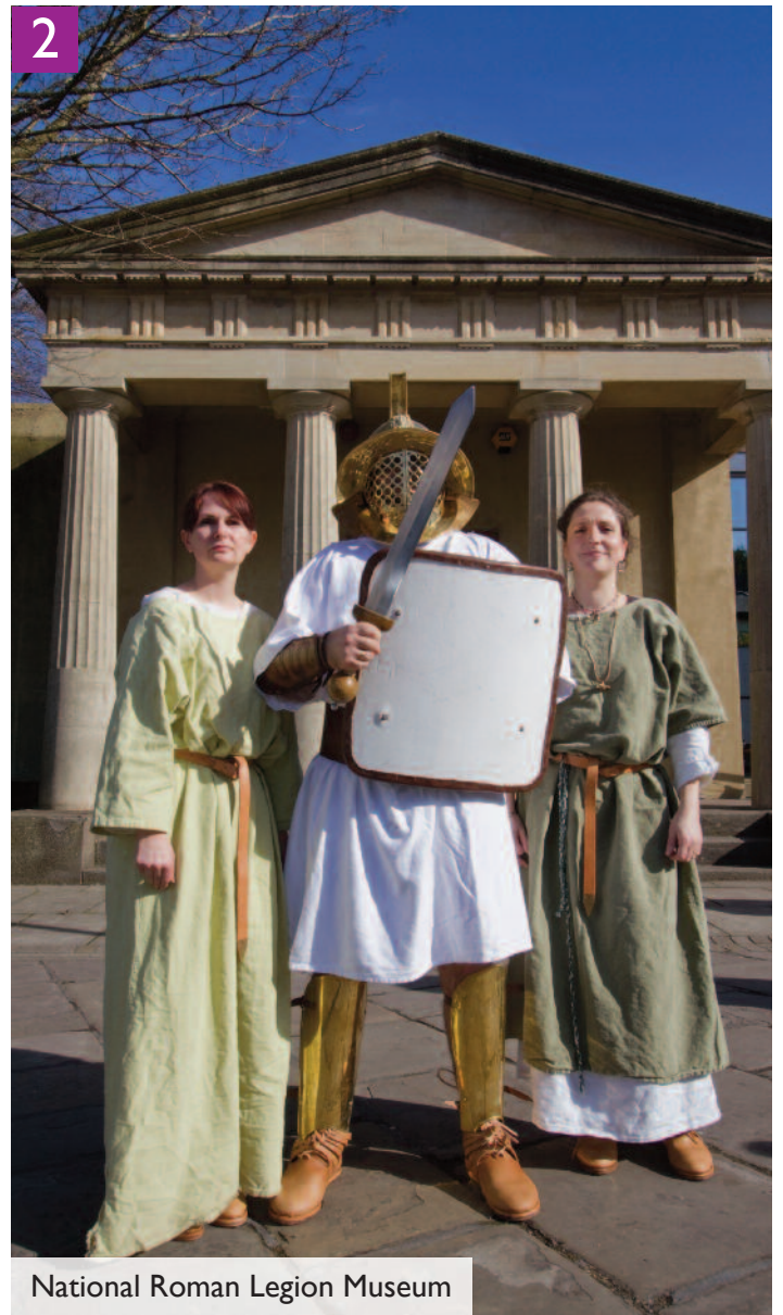
National Roman Legion Museum

Caerleon is one of the most varied and fascinating Roman sites in Britain, incorporating Caerleon Roman Fortress and Baths , a well-preserved amphitheatre and a row of barrack blocks — the only examples currently visible in Europe. With heated changing rooms, a selection of cold or warm baths, covered exercise rooms and even an open-air swimming pool, the remains clearly visible at Caerleon suggest that Roman life was at times comfortable and luxurious. Visitors can step back in time and see history brought to life through modern technology, including animated touch screen games and a light and sound show to create the illusion of 3D swimmers using the baths, as well as information panels, audio posts and humorous silent films.