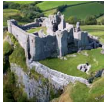
Carreg Cennen Castle