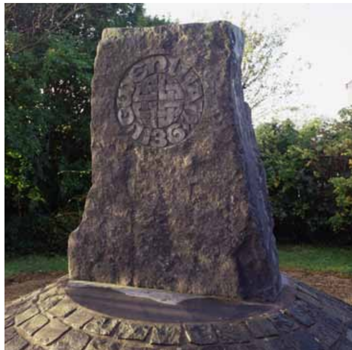
A memorial dedicated to Gwenllian at Kidwelly Castle