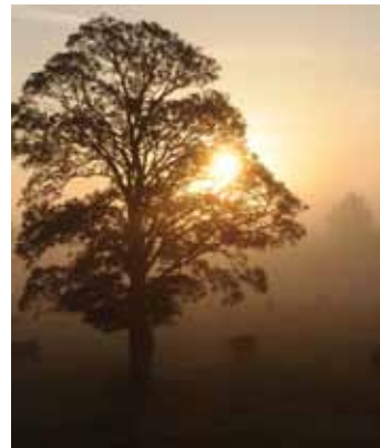
The Tywi valley where Gwenllian fled.

Gwenllian and Maelgwn were captured. Maurice de Londres showed no mercy – to set an example to all Welsh princes, he had Gwenllian beheaded for treason. It is said that a spring welled up where the brave Princess Gwenllian died – a place now known as Maes Gwenllian (Field of Gwenllian).