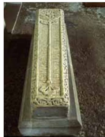
The tombstone of Maurice de Londres at Ewenny Priory