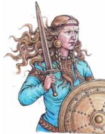
Gwenllian: the Welsh Warrior Princess

Gwenllian was a brave and beautiful Welsh princess who died trying to save her country from Norman invaders. She was the daughter of Gruffudd ap Cynan, ruler of Gwynedd (northern Wales).