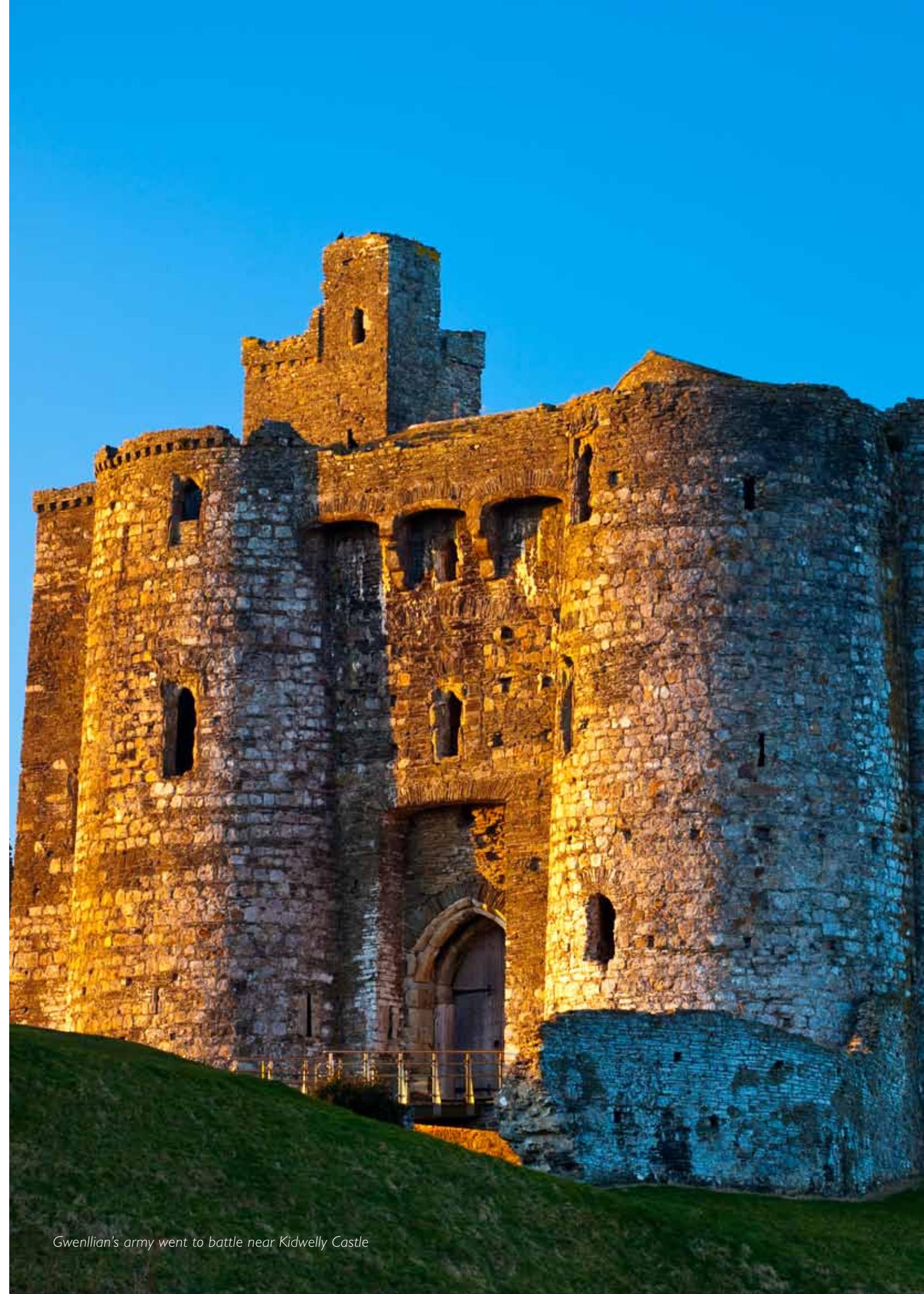
Gwenllian's army went to battle near Kidwelly Castle