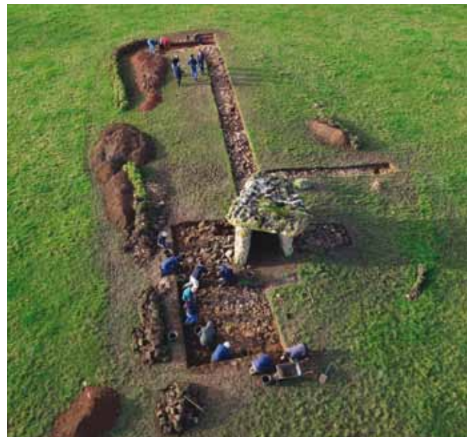
The excavations in progress at St Lythans

• Although the Tinkinswood Community Archaeology Project has finished, you can still visit the website — http://tinkinswoodarchaeology.wordpress.com/ — to learn more about the project and read the dig blogs.