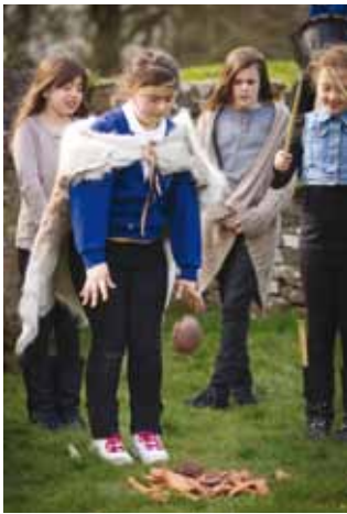
An offering for the ancestors — at one of the Make and Break events

One of our most exciting results was the recovery of charcoal samples from the prehistoric ground surface beneath the monument. Radiocarbon dating of these