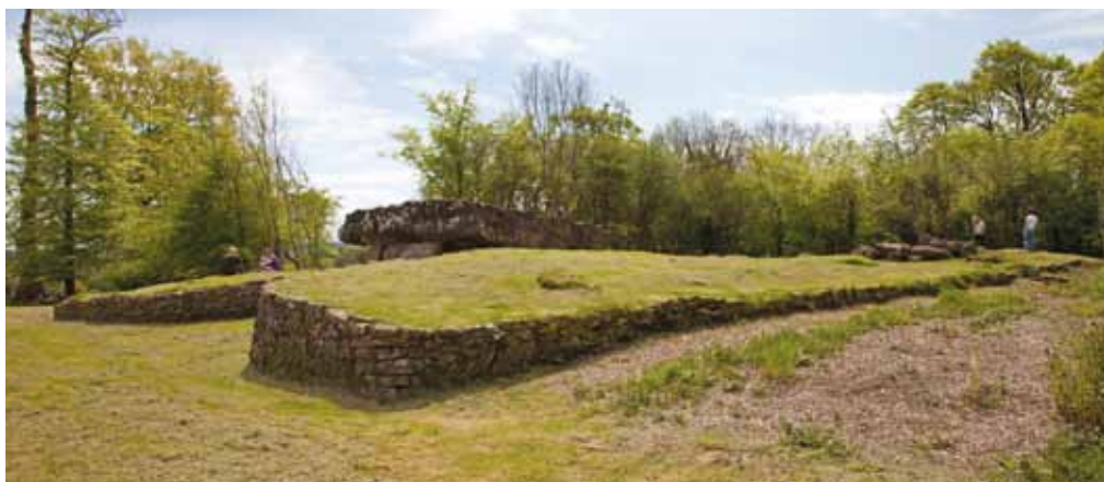
The full extent of the monument at Tinkinswood can be appreciated after the vegetation clearance

The group fenced the adjacent area, known as 'The Quarry', so it could be opened to visitors for the first time. This has long been proposed as the source for Tinkinswood's enormous 40-tonne capstone — one of the largest in Britain.