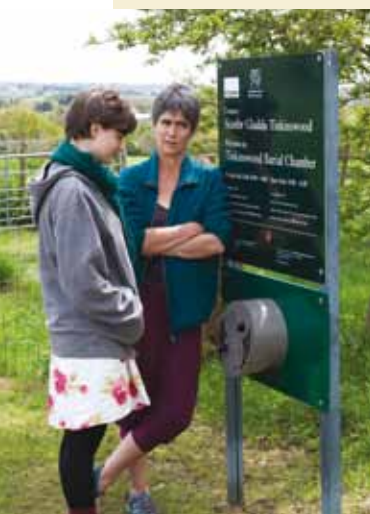
Visitors enjoying the new audiopost at Tinkinswood

the lane downhill about 150m (165 yards) to a stile on the left. Cross the stile, and follow the path through a stand of trees and through several fields to reach a track climbing up from the Ely Valley. Turn left and follow the track back to St Nicholas.