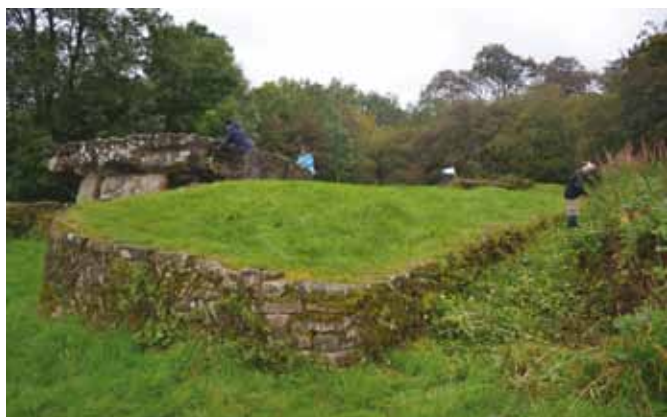
Volunteers from the British Trust for Conservation Volunteers taming the encroaching vegetation at Tinkinswood

At Tinkinswood, the project built on pioneering investigations by John Ward, keeper of archaeology at the National Museum of Wales, in 1914. Ward showed that a roughly rectangular mound, or cairn, revetted with drystone walls, surrounded the chamber — except on the east where the walls curved in to create a forecourt before the tomb's entrance. These are all characteristic features of so-called Cotswold-Severn tombs. More than 900 fragments