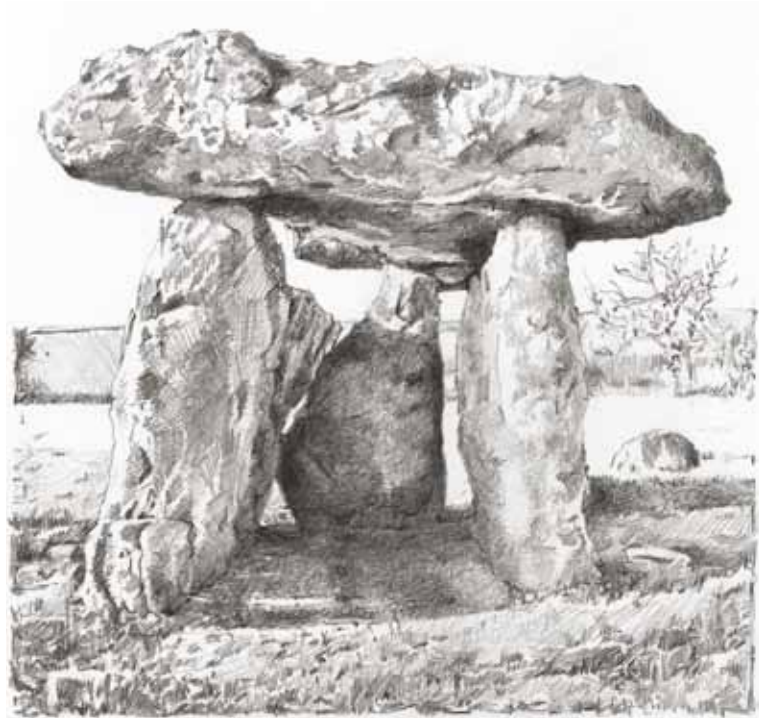
A drawing of the burial chamber at St Lythans by Helen Hywel, one of the project volunteers

start because the drums had a catchy beat, but then we got to the pot breaking and then it got spooky and a bit eerie because it seemed like we were in a trance ...'