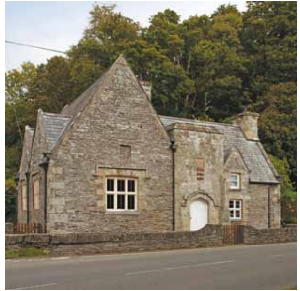
The College (D) at Felindre Farchog incorporates parts of an early seventeenth-century school

the tenth or the early eleventh century.