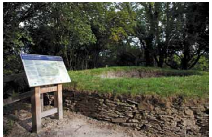
The round tower on the motte at Nevern Castle (A) with one of the new interpretation panels informed by recent archaeological discoveries

of Wales's outstanding early Christian monuments. Its intricate decoration and details of its construction show close parallels with the Carew Cross (the inspiration for Cadw's logo). Both were probably produced by the same artist in the second half of