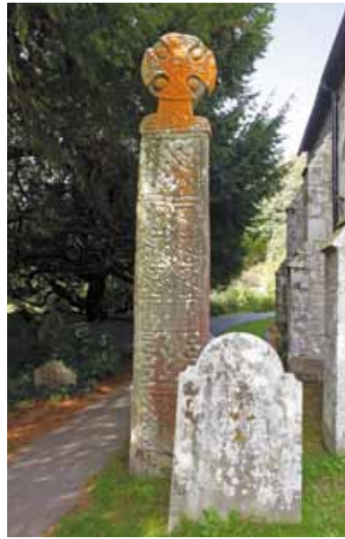
The Nevern Cross (C) is one of Wales's outstanding early Christian monuments