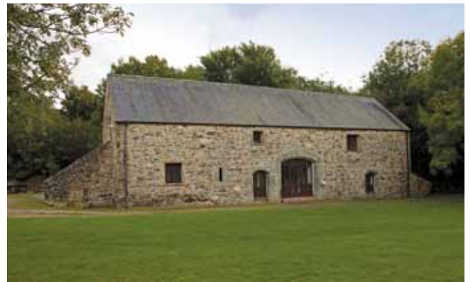
The former barn at Pentre Ifan Farm (F) is all that survives of the Tudor mansion of the Bowen family

Nearing the end of your walk, before you cross the river and climb back up to Nevern Castle, notice the well-built bridge (G) of the late eighteenth or early nineteenth century. ✚