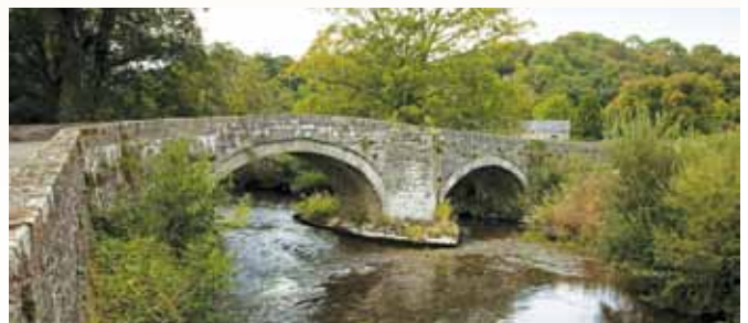
The bridge at Neverm (G)

After passing the Trewern Arms Inn, cross the bridge over the river (G), turn left and climb to the castle.