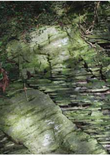
The Pilgrims' Cross (B) is linked to the pilgrimage to St Davids