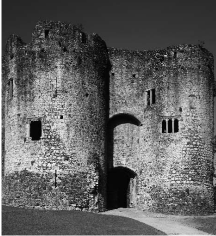
The twin-towered gatehouse guarding the entrance to the castle.