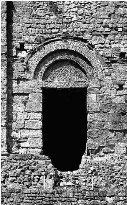
The doorway to the great tower.

Cellar for storing barrels of beer and wine. Doorway onto cliff edge through which they were winched up from boats below.