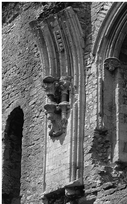
Part of the arch built to divide the first-floor room in the great tower in the thirteenth century. The carving is of the highest quality.

Later, the first floor was divided in two by a pair of large ornate arches. A second floor room was added above the west end at same time. Three ornate windows replaced the narrow ones on the first floor. Only their upper parts were glazed; the lower parts had shutters. There are window seats in each.