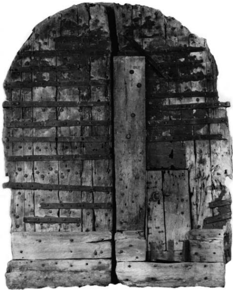
The original castle doors from the main gatehouse. They date from no later than the 1190s.