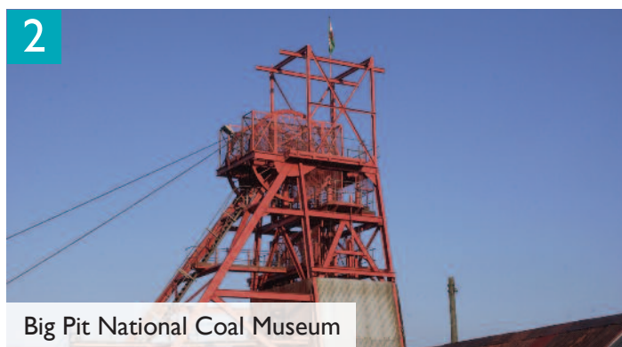
Big Pit National Coal Museum

Just under an hour's drive from the capital city of Cardiff, in the famous south Wales Valleys stand Blaenavon Ironworks . The ironworks were a milestone in the history of the Industrial Revolution and at the time were at the cutting-edge of new technology. The power of steam was harnessed and a way of making steel using iron-ore was developed, which led to a worldwide boom in the steel industry, taking Wales's industrial might to a new height. Visitors to the site can see the refurbished Stack Square cottages, to see how the workers lived through the ages, and the recreated company truck shop. New, cutting-edge audio-post technology helps bring the story of the Ironworks to life like never before. The landscape of Blaenavon has gained World Heritage status as a result of its revolutionary form and function. From mines to train lines, you can still trace the routes in and routes out, from raw material to finished product.