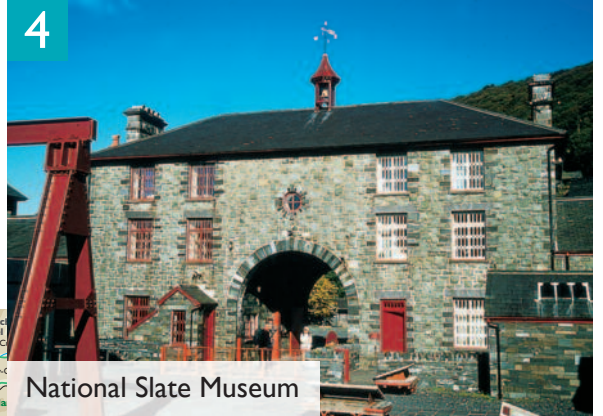
4 National Slate Museum

Visit museumwales.ac.uk , 'Like' Museums Wales on Facebook and follow @AmgueddfaCymru.