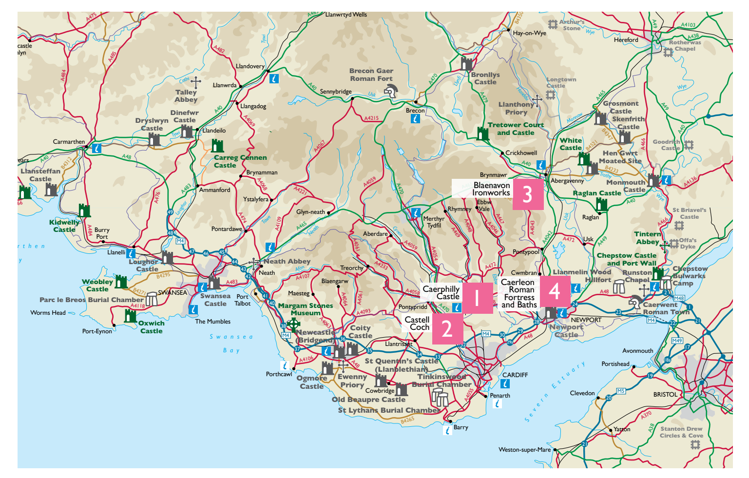
The journey time from Cardiff to Castell Coch is approx. 15 minutes, 20 minutes to Caerphilly, 30 minutes to Caerleaon and 45 minutes to Blaenavon.