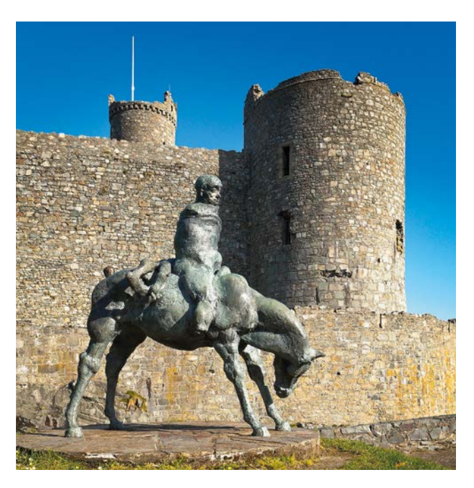
Top: A statue of Bendigeidfran stands outside Harlech Castle