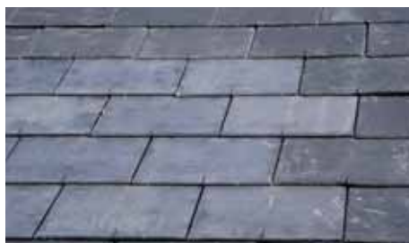
Above and left: There are some good examples of PV roof cladding that emulate the look of natural slate and the technology is constantly evolving. The slates pictured have the advantage of being thin and non-reflective, though rarely will they be a suitable substitute for Welsh slate on a principal roof slope.