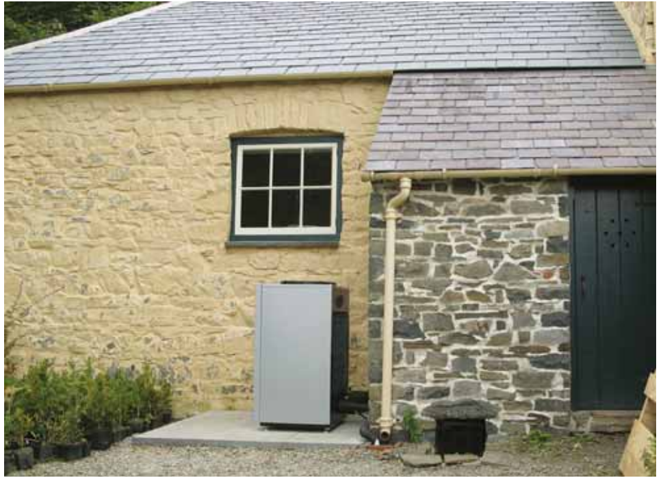
This ground-source heat pump is connected to an under-floor heating system and is sited in the service area to the rear of a converted stable block so as to be as discreet as possible.

The impact of micro-generation technologies on the setting of a historic building or monument is also important. With care, most types of free-standing equipment may be successfully integrated into the landscape or screened from view. However, this integration is much more difficult to achieve with micro wind turbines. A well-chosen site should allow the turbine to be viewed against a landscape setting rather than open sky, and also for its height to be as low as possible. In addition, the potential impact of noise, vibration and shadow flicker on your and neighbouring properties should be considered. In sensitive locations it might be preferable to use other forms of renewable energy.