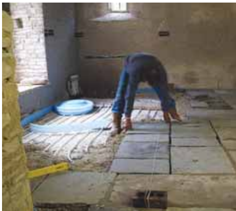
© Green Dragon Energy — www.greendragonenergy.com