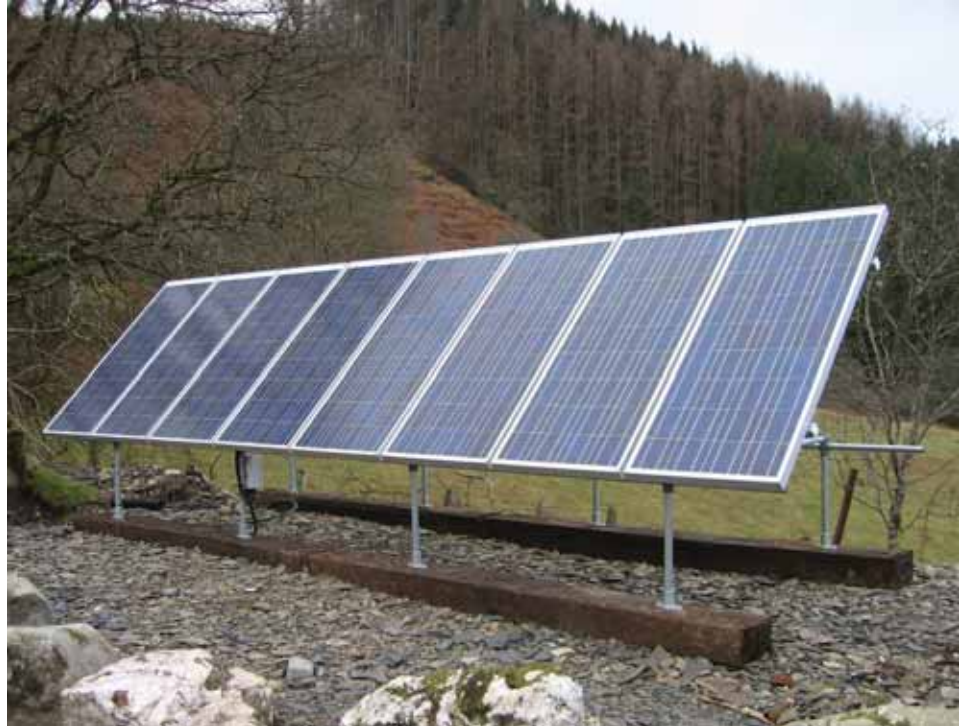
Try to install solar panels and photovoltaic (PV) arrays as free-standing units if possible. The impact of this installation could have been further reduced by choosing a dark coloured frame and providing some soft landscaping.

In a photovoltaic system, light hitting the silicon in a solar photovoltaic (PV) cell is converted directly into electricity. The greater the intensity of light, the greater the flow of electricity. Individual PV cells are connected together to form a module. Modules are linked to form a PV array. After conversion from direct current (DC) to alternating current (AC), the power generated by the cells is carried into the building's normal electrical system to work alongside the existing electricity supply. Excess power should ideally be exported to the National Grid to help offset the cost of buying electricity back during the night and at other periods of low electricity