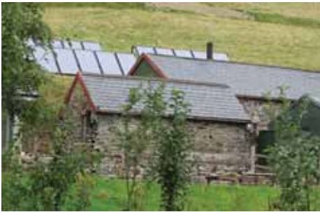
Above and left: The banks of solar panels serving the listed farmhouse and holiday cottage at this site are situated on the hillside behind the agricultural buildings and can only be seen at a distance. The robust scale and simple form of the installation is fitting in this location and does not detract from the setting of the listed buildings.

commonplace in the future. Whereas most buildings are capable of accommodating a degree of change, multiple installations may have an unexpected cumulative visual impact.