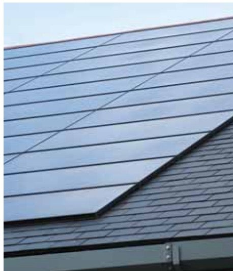
The area of a typical domestic-sized PV system will be 10–15 square metres. These units are less obtrusive than many due to their colour and simple design.