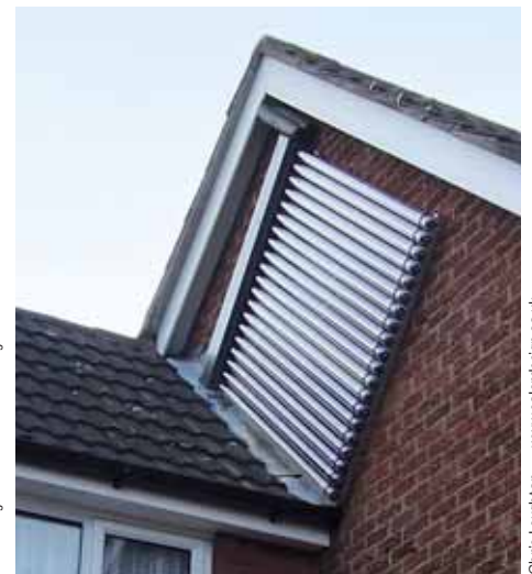
Chris Loughton — www.solar-design.co.uk

Installing solar panels at a low angle on a flat roof can be a good choice for a historic building. However, care is needed when installing them on a lead roof as the lead sheet may tear if it is not allowed to expand and contract naturally.