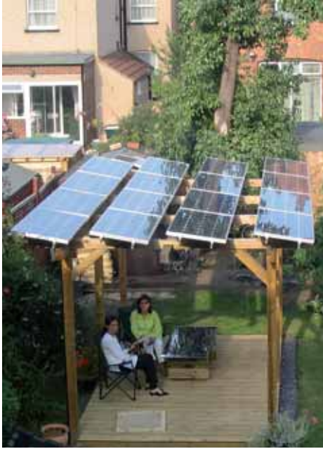
PV Systems Ltd — www.pvsystems.com