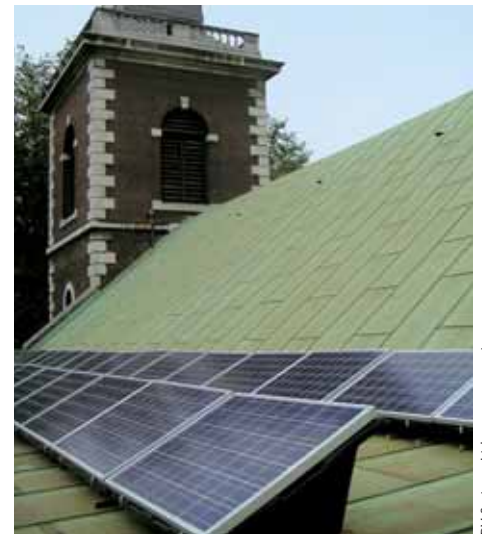
These PV arrays have been installed as bespoke free-standing units that stand on a flat roof hidden behind a parapet wall.