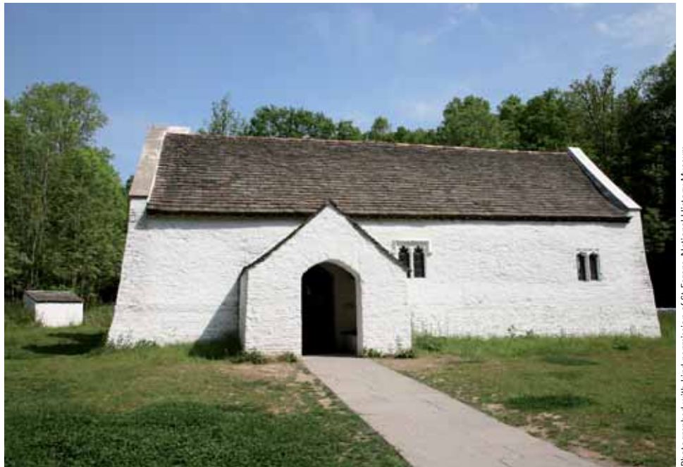
The control equipment for the ground-source heat pump at this site is housed in a purpose-built stone outhouse that echoes the design and materials used in the church itself.