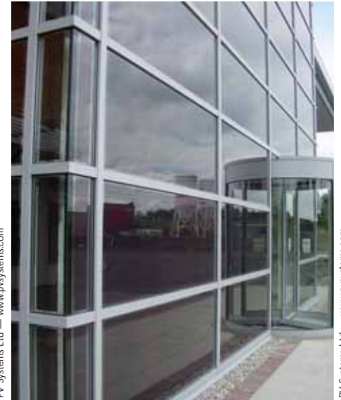
Above left and right: Amorphous silicon cells can be used to coat glass. This example is on a new building, but this type of glass set into a well-designed frame could be used to good effect on historic buildings where large areas of new glazing are proposed, such as a threshing barn that is being converted to domestic use.