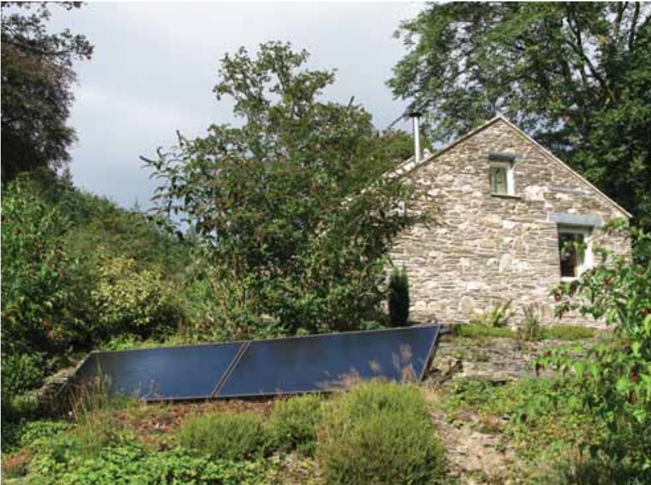
These free-standing solar hot-water panels have been carefully sited so as to blend in with the surrounding rockery and planting scheme.

Once you have chosen the most suitable form of micro-generation technology for your historic building or environment, you should make further efforts to ensure it is well integrated. Although every historic building will present different options to minimize the impact, the following are key issues which should be considered for every installation.