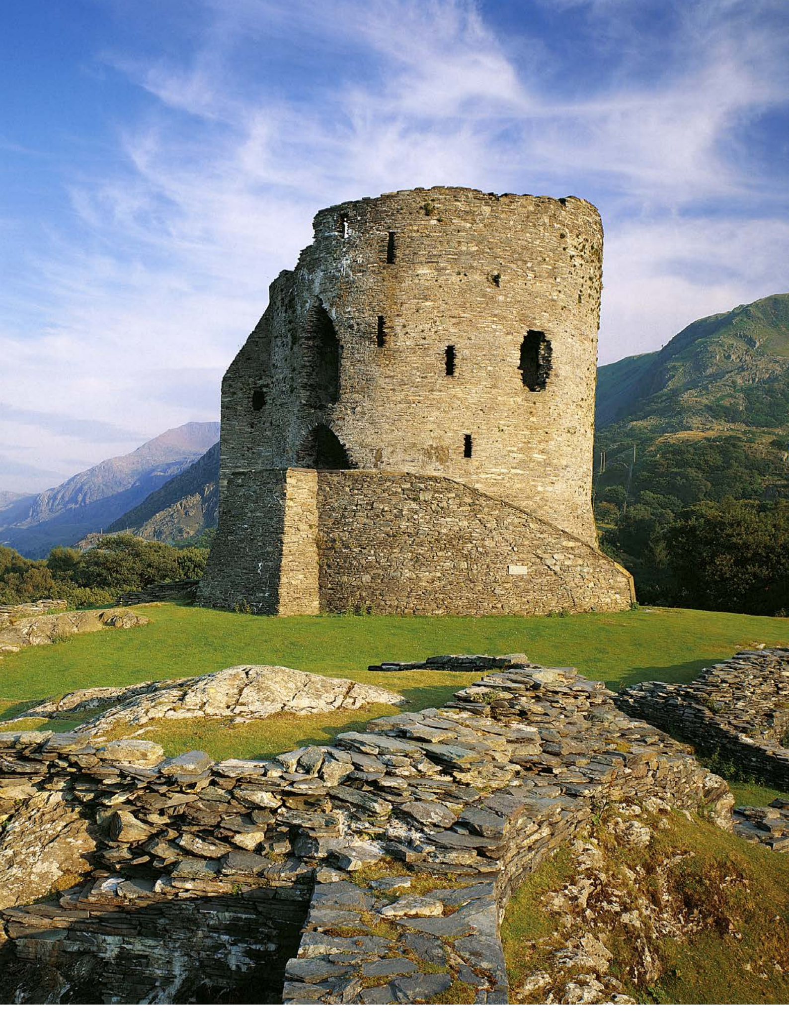
Dolbadarn Castle, Gwynedd, built by Prince Llywelyn ap lorwerth in the early years of the thirteenth century.