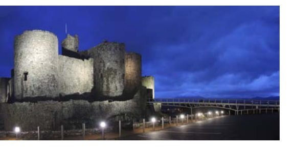
A new bridge and new interpretation at Harlech Castle have made the site more physically and intellectually accessible.