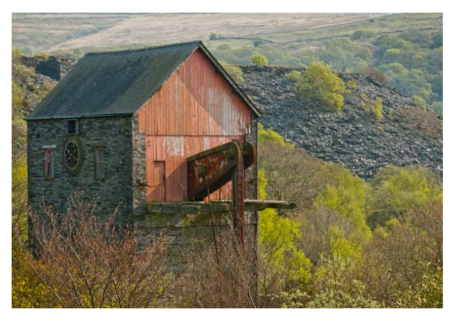
The Cornish beam engine at Dorothea Quarry, Nantlle, is an evocative reminder of why the slate industry of north-west Wales is worthy of nomination for World Heritage Site status. Partnership working will be essential to the success of this bid.

Beyond government, the sector has already demonstrated the value of partnership through the Historic Environment Group, which has produced invaluable work as the sector faces up to future challenges, such as climate change and the implications of leaving the European Union. I will continue to encourage Cadw to share experiences with third sector organisations and funding partners, including the National Trust and the Heritage Lottery Fund. We will also continue to work with delivery partners, including the Royal Commission on the Ancient and Historical Monuments of Wales and the Welsh archaeological trusts, who have done so much to improve our understanding of the past, to access information and to engage people in active participation. Another partnership that is already demonstrating its value is the Welsh Places of Worship Forum, which is helping to tackle a consequence of declining religious congregations: the increasing numbers of chapels and churches, which were once at the heart of many of our communities, now becoming redundant.