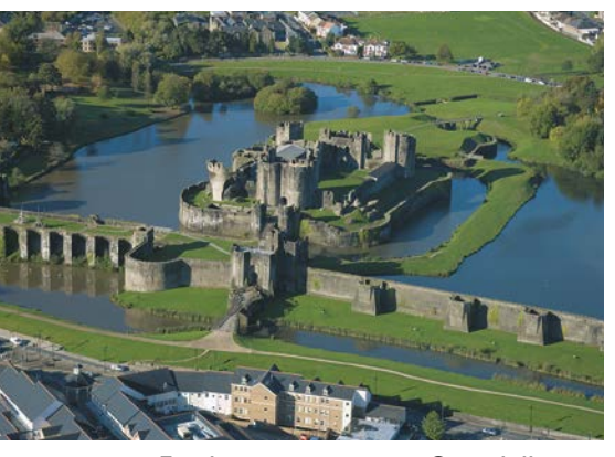
Further investment at Caerphilly Castle will benefit the local community and improve visitors' experience.