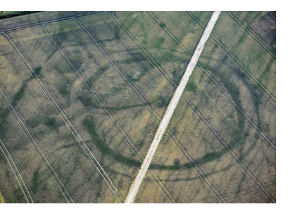
In dry summers like 2018, aerial photography reveals buried archaeological sites like this enclosure in the Vale of Glamorgan.

and to ensure that we have the skills across the sector to support their conservation. We also need to help people enjoy and appreciate our historic sites, and to encourage greater and more active participation in looking after our heritage. Finally, to realise fully the contribution that the historic environment can make to our economic well-being. These themes are interdependent. We cannot realise the economic value of our heritage if we do not care for it. We must identify and protect those individual historic sites or landscapes that matter to us and fully integrate their value in future plans for revitalising our communities. Similarly, we will build on how our historic sites are valued and appreciated by surrounding communities if we are also able to demonstrate that they are making a real contribution to the local economy.