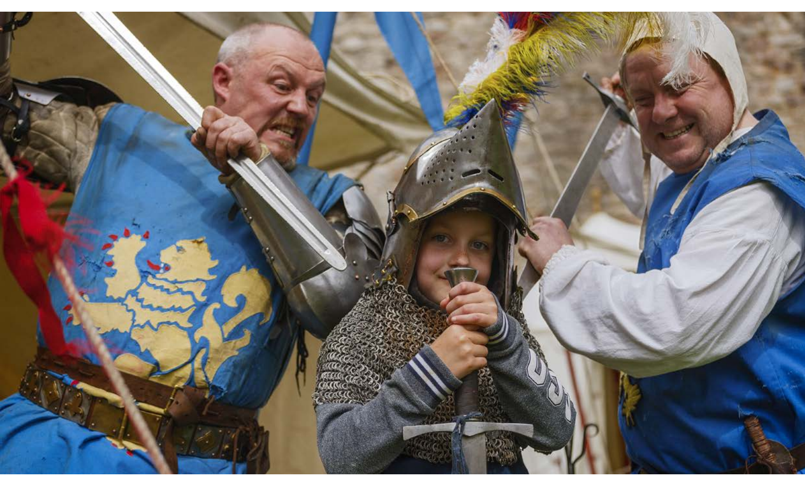
Family fun at Chepstow Castle.