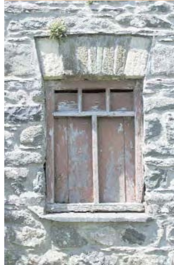
Gwaith carreg a atgyweiriwyd drwy ddefnyddio mortar calch, a ffenestr nodedig a gadwyd.

Stonework repaired using lime mortar, and a distinctive window retained.