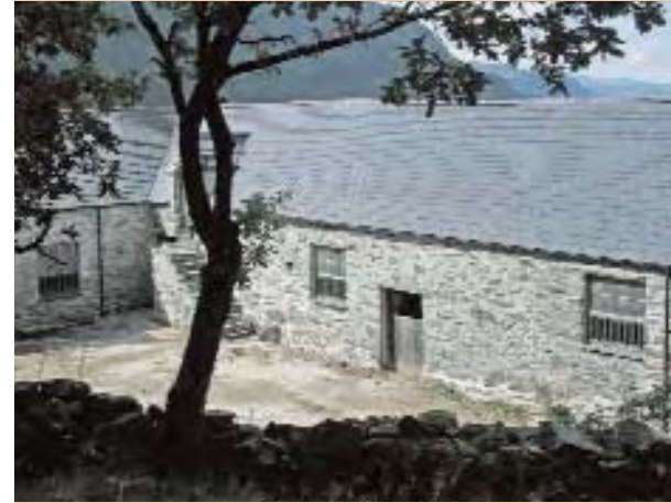
Gyferbyn: Cysgodfan gyda llwybr wedi'i godi ar fferm yn Sir Fynwy. Uchod: Rhes amaethyddol ar gynllun L ar fferm yng nogledd Eryri, a ddatblygwyd yn y bedwaredd ganrif ar bymtheg drwy gyfuno dwy hen ysgubor, gyda llety uchel i dda byw.

Farm buildings often survive such changes in the economy of the farm, and provide evidence for abandoned modes of farming.