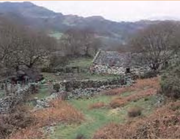
Beudy ger Dolgellau, Gwynedd.

A field cow house near Dolgellau, Gwynedd.