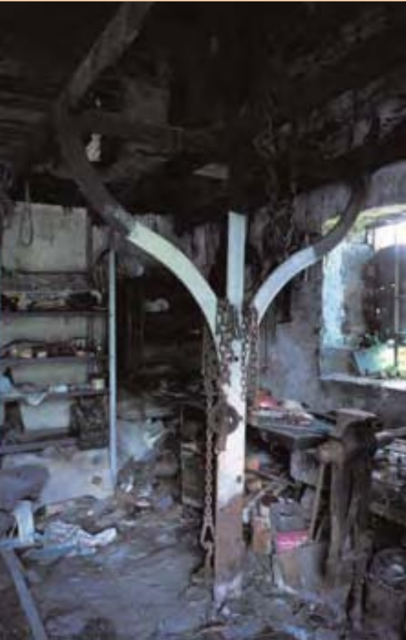
Uchod: Pyst rhwymo o haearn yn stablau Gweithiau Haearn Nant-y-glo. Gyferbyn: Corau pren, cafnau bwyd a rheseli gwellt ar fferm yn Sir Benfro.

Above: Iron tethering posts in the stables of the Nant-y-glo Ironworks. Opposite: Timber stalls, feeding troughs and hay racks in a Pembrokeshire farm.