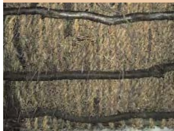
Brig: Strwythur cellog corlan ddefaid yn Eryri (CBHC). Polion garw a gwellt a ddefnyddiwyd i doi beudy fferm fach yng Ngheredigion (uchod).