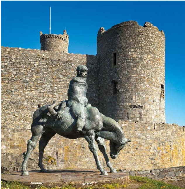
Top: A statue of Bendigeidfran stands outside Harlech Castle