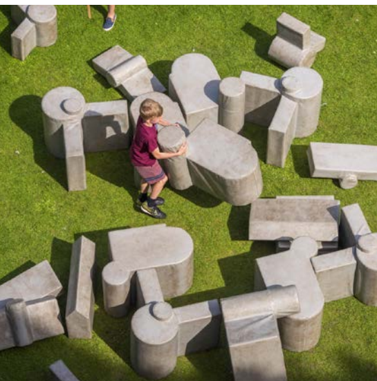
Learning activity at Beaumaris Castle.

We offer opportunities to volunteer at Cadw sites and encourage people to take part in schemes to improve access to other parts of the historic environment. These can range from bracken clearance through to opening up places that are not normally accessible to the public. These activities offer a wide range of life skills that can improve health and well-being as well as bring employment opportunities at any time of life.