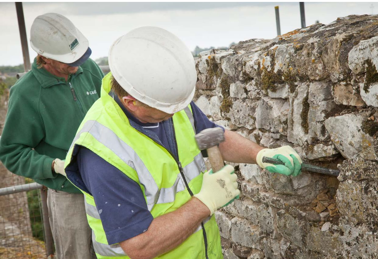
Skilled Cadw craftspeople at work.