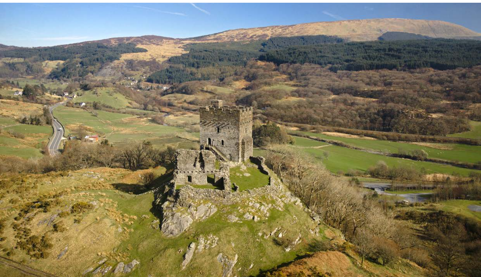
Dolwyddelan Castle, built by the Welsh prince, Llywelyn ap Iorwerth, in the heart of Snowdonia.