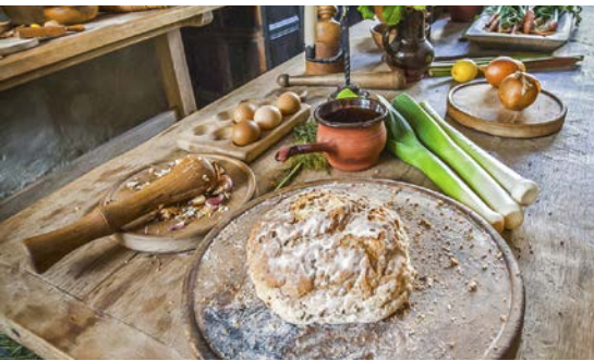
The kitchen at Plas Mawr Elizabethan Townhouse, Conwy.