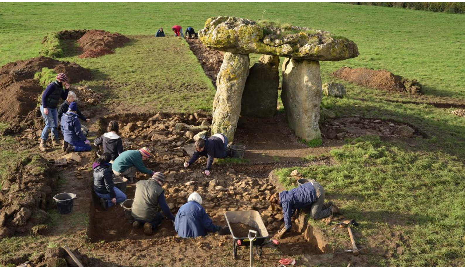
Community archaeology in action at St Lythans burial chamber.