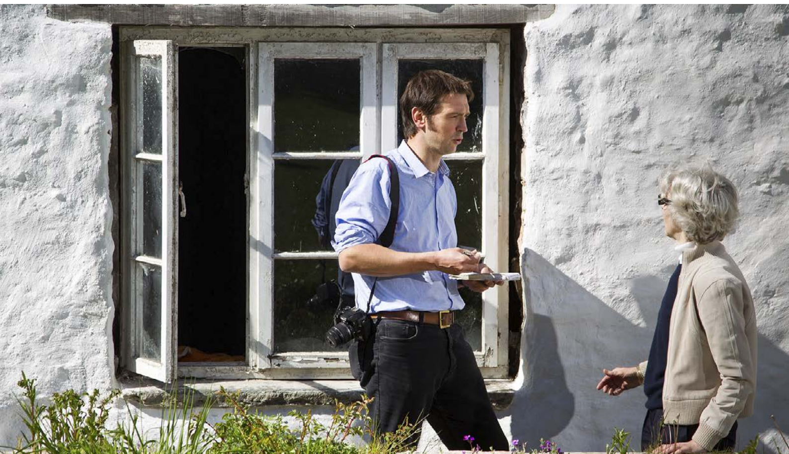
One of Cadw's listed buildings team explaining the historic importance of a house to the owner.