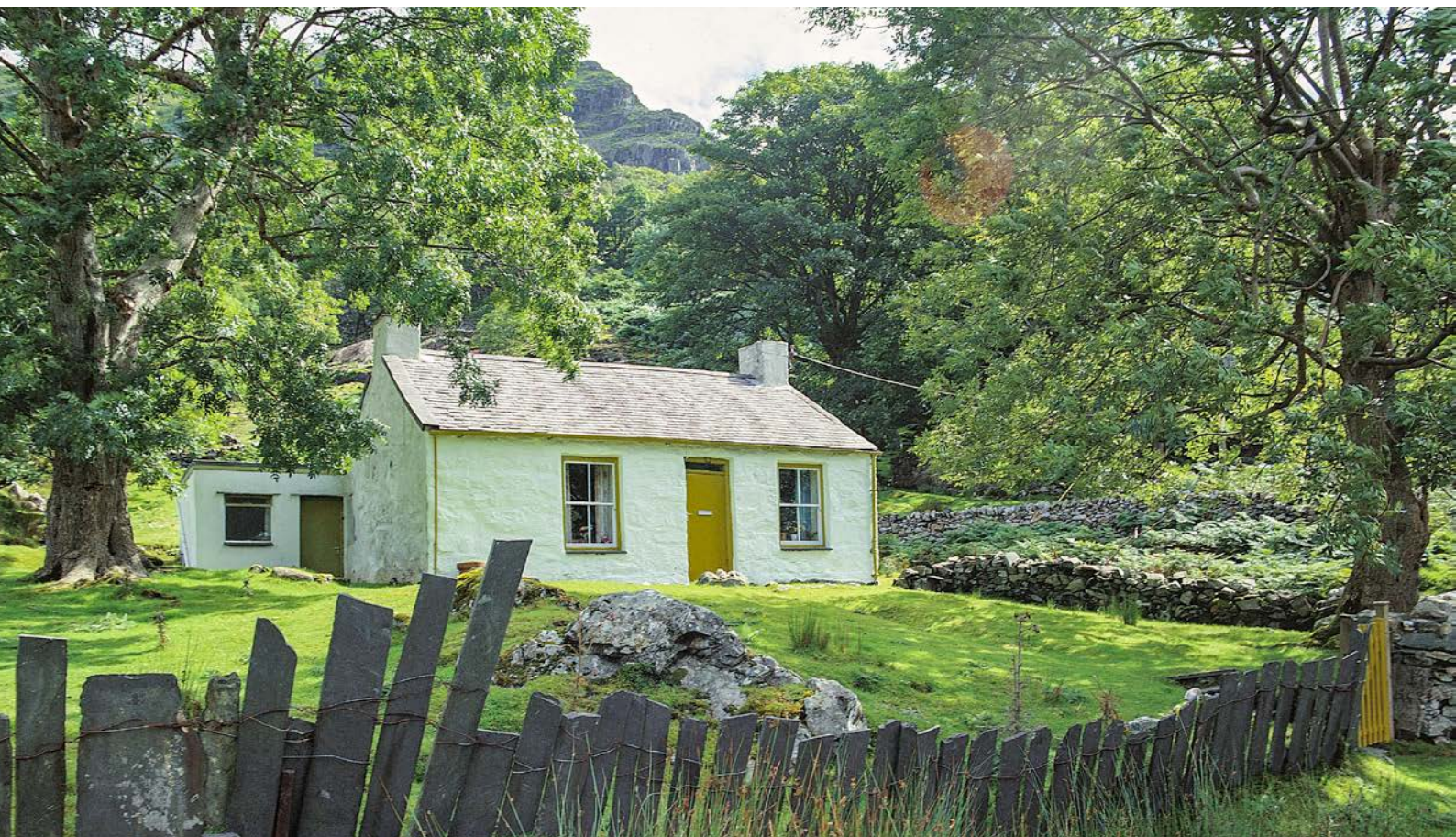
An isolated grade II listed quarry worker's cottage near Llanberis, Gwynedd.