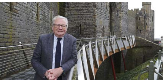
Lord Elis-Thomas at Caernarfon Castle.

Cadw is a Welsh word meaning 'to keep' or 'to protect'.