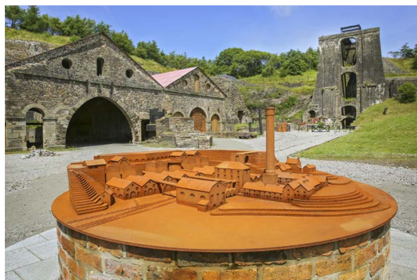
State-of-the-art interpretation at Blaenavon Ironworks explains how this complex industrial site once worked.